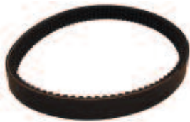
Drive Belt, E-Z-Go Marathon 4-Cycle Gas 91-94 & 2-Cycle Gas 92-93 OEM: 27077G01; 27077G02. BLT-0006