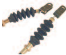
Accelerator Cable, Yamaha Gas G16/G22 (Gov to Carb) Length: 32¾". OEM: JN6-F6312-01. CBL-021