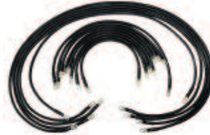
Club Car DS 48V PowerDrive Elec 95+ BAT-1007