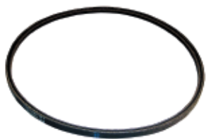
Generator Belt, Club Car 97+ (OHV) OEM: 1019167-01. BLT-0012