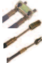
Brake Cable Set, E-Z-Go 91-94 4-cycle Length: 49". OEM: 70273-G02; 27084G01. CBL-045