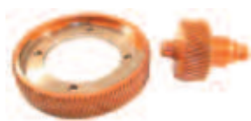
E-Z-Go Electric and 2 Cycle, 6:1 Ratio GEAR-010