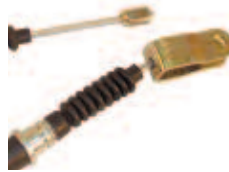
Brake Cable, Club Car 00+ Length: 41½". OEM: 1020221-01; 1019907. CBL-017