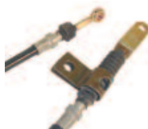
Brake Cable, Driver, Yamaha Gas & Electric G8/G14, Elec G16/G19 Length: 43¼". OEM: JF2-F6341-00. CBL-009