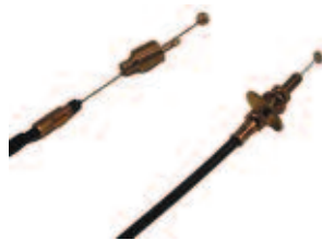
Accelerator Cable, Club Car Gas 92-96 Length: 31". OEM: 1015225. CBL-025