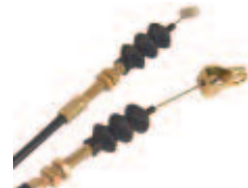
Throttle Cable, Yamaha Gas G2/G8/G9/G11 (Pedal to Gov) Length: 63⅝". OEM: J55-F6311-00; J38-26311-00. CBL-048