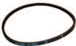
Generator Belt, Yamaha G2, G8, G9, G14, Drive 4-Cycle Gas 85+ OEM: J38-81173-00; J55-H1173-00. BLT-0002