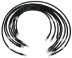
E-Z-Go PDS Electric 94 & Up BAT-1006

Beefed Up Cables for Beefed Up Cars :: Complete 4 Gauge Battery Cable Sets