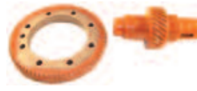
Club Car Gas 97+, 6:1 Ratio GEAR-003