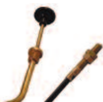
Choke Cable, E-Z-Go 96+ Length: 25½". OEM: 25693-G04. CBL-034