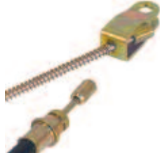
Brake Cable, Passenger, E-Z-Go Medalist/TXT 94+ Length: 47½". OEM: 28084-G05; 25884G05. CBL-041