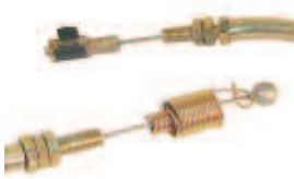
Throttle Cable, Club Car Gas 84-91 Length: 17¼". OEM: 1013158; 1010867; 1013163. CBL-024