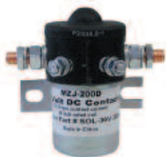
Heavy Duty Solenoid, 200 Amp, 36 Volt SOL-1020

For use in high amperage applications including lifted cars, multi-passenger vehicles and trailers. Alltrax Controllers require Heavy Duty Solenoids for all 400 AMP+ applications.