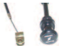
Choke Cable, Yamaha Gas G8/G14 Length: 21". CBL-052