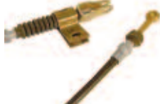
Brake Cable, Driver, Yamaha Gas G16/G20 Length: 43½". OEM: JN6-F6341-00. CBL-006