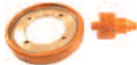
Yamaha G14/G16/ G19, 8:1 Ratio GEAR-011