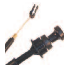
Choke Cable, Seat Mount, Yamaha G16/G20 Length: 12¾". OEM: JN6-F6331-00. CBL-007