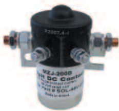
Heavy Duty Solenoid, 200 Amp, 48 Volt SOL-1021