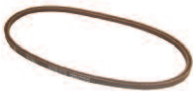
Generator Belt, Yamaha G11, G16, G20, G21, G22 4-Cycle Gas 96+ OEM: JN6-H1173-00. BLT-0015