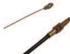
Accelerator Cable, E-Z-Go Workhorse Length: 46". OEM: 72065-G02. CBL-018