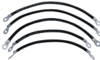
Yamaha G14/G16 36V Electric 94+ Includes three 12" and two 9" 4 gauge black cables. BAT-1005A