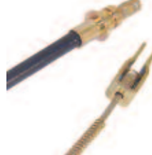
Brake Cable, Driver, E-Z-Go 93-94 Length: 33½". OEM: 28084G01; 28084G02; 28084G03; 25884G01; 25884G02. CBL-039