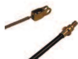
Brake Cable, Passenger, E-Z-Go 91-94 4 cycle Length: 49". OEM: 27084G01; 28084G07. CBL-043