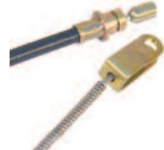
Brake Cable, Passenger, E-Z-Go 93-94 Length: 45¼". OEM: 28084G01; 28084G02; 28084G03; 25884G01; 25884G02. CBL-038