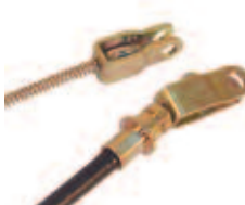
Brake Cable, Driver, E-Z-Go 91-92 Length: 36". OEM: 25789-G1; 70715G04. CBL-036