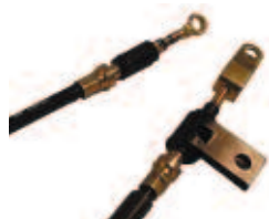
Brake Cable, Passenger, Yamaha Gas & Electric G8/G14/G16/G19/G20 Length: 53½". OEM: JF2-F6351-10. CBL-008