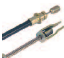
Governor Cable, Club Car Gas 97-03.5, FE290 only Length: 27½". OEM: 1018324-01. CBL-014