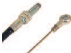
Accelerator Cable, E-Z-Go Medalist/TXT Length: 36⅝". OEM: 72065-G01. CBL-047