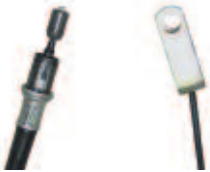
Brake Cable, Club Car Precedent 04+, Passenger Side Length: 49". OEM: 1025575-01. CBL-053