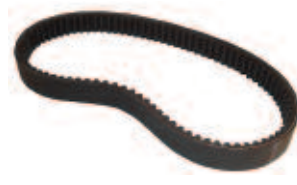
Drive Belt, Yamaha G1 2-Cycle Gas 78-89 OEM: J10-46241-00; J17-46241-00. BLT-0008