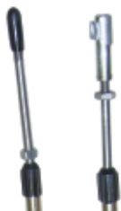
Forward/Reverse Cable, E-Z-Go Gas 4 Cycle 02+ Length: 67¼". OEM: 72734G01. CBL-055