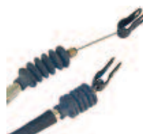
Brake Cable, Driver, E-Z-Go 91-94 4 cycle Length: 35". OEM: 28084-G06; 27084G02. CBL-042