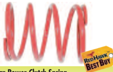
Club Car Power Clutch Spring Item # CP-0102