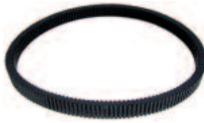
Drive Belt, E-Z-Go Workhorse 4 Cycle 96+, 28° Clutch OE OEM: 72328G01. BLT-0021