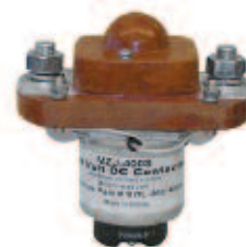
Heavy Duty Solenoid, 400 Amp, 36 Volt SOL-1023