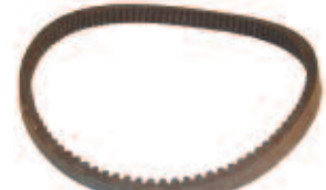
Drive Belt, E-Z-Go 2-Cycle Gas 76-87 OEM: 14153G1. BLT-0016