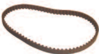
Timing Belt, E-Z-Go 4 Cycle Gas 91+ OE OEM: 26626G01. BLT-0017