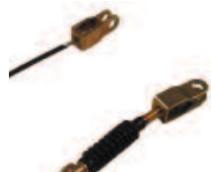
Brake Cable, Driver, Yamaha Gas G2/G9 Length: 38½". OEM: J55-F6341-00. CBL-013