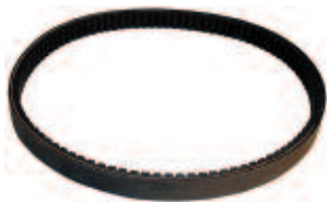
Drive Belt, Yamaha Drive OE OEM: JW1-G6241-10-00. BLT-0024