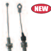
Accelerator Cable, E-Z-Go MG5/Shuttle Length: 63½". OEM: 72402G01. CBL-060