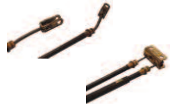
Brake Cable Set, E-Z-Go 93-94 Length: 46". OEM: 70273-G01; 28084G03. CBL-044