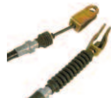
Brake Cable, Driver, Yamaha G1A+E/G2E/G9E Length: 38¾". OEM: J56-F6341-00; J10-26341-00. CBL-001