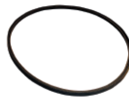
Generator Belt, Club Car Gas 84-87 OEM: 1012338. BLT-0009