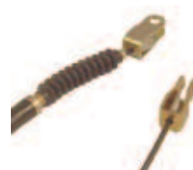
Brake Cable, Passenger, Yamaha Gas G2/G9 Length: 51". OEM: J55-F6351-01-00. CBL-012