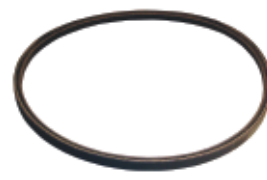
Generator Belt, Yamaha G1 2-Cycle Gas 78-89 OEM: J10-81173-00. BLT-0014

SEAT KITS, BOXES, CUSTOM SEAT COVERS DIAMOND PLATE BRUSH GUARDS LIFT KITS, FINNER FLARES TIRES, WHEELS, WHEEL ACCESSORIES WINDSHIELDS, TOPS, STRUTS, ENCLOSURES LIGHT KITS, MIRRORS, GUN RACKS, HEATERS DASHES, CONSOLES, RADIO SYSTEMS MOTORS, CONTROLLERS CHARGERS & PARTS, BATTERY ACCESSORIES BODY/TRIM, SEATS, SUSPENSION PARTS BRAKE SHOES, BRAKE DRUMS KEYS, SWITCHES, SOLENOIDS GAS CAR PARTS BELTS, CABLES, HARDWARE, PERFORMANCE PARTS