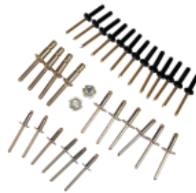
E-Z-Go TXT Body Rivet Kit Includes all rivets needed to rebody an E-Z-Go TXT cart. OEM: 750102PKG. RIV-023