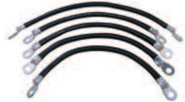
Club Car DS 48V Elec 95+ Includes five 14" 4 gauge black cables. BAT-1002A