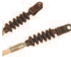
Governor Cable, Club Car Gas 92-96, FE290 only Length: 16⅜". OEM: 1018324-01. CBL-026