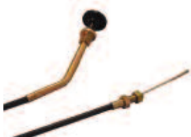
Choke Cable, E-Z-Go Workhorse 96 & Up Length: 33½". OEM: 72401-G02. CBL-020