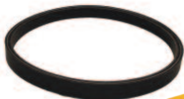
Drive Belt, Club Car Gas 92+ OEM: 1016203. Item # BLT-0005