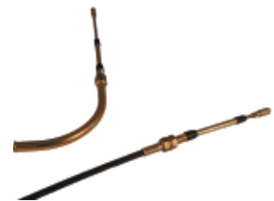
Forward/Reverse Cable, Club Car 84-97 Length: 63". OEM: 1012326; 1013085; 1018510-02. CBL-023