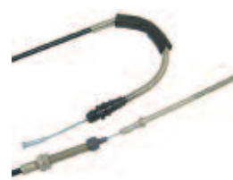
Accelerator Cable, E-Z-Go Gas 03+ Length: 49¾". OEM: 72713G01. CBL-050