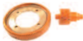
E-Z-Go Electric and 2 Cycle, 8:1 Ratio GEAR-011