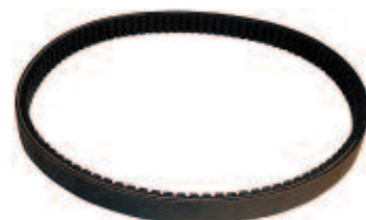
Drive Belt, Club Car Gas 84-87 OEM: 1012289. BLT-0003