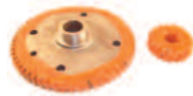
E-Z-Go Gas, Small Bearing, O.D. 1.378, 8:1 Ratio GEAR-009