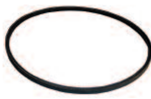
Generator Belt, Club Car Gas 88-91 & 94 OEM: 1014290. BLT-0010