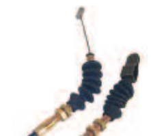
Throttle Cable, Yamaha Gas G14/G16/G22 (Pedal to Gov) Length: 67½". OEM: JN3-F6311-00. CBL-049