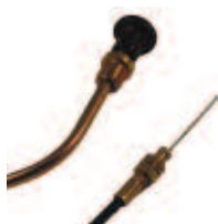
Choke Cable, E-Z-Go 94-95, Medalist Length: 21½". OEM: 25693-G03. CBL-033