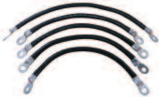
E-Z-Go Med/TXT Electric 94+ Includes one 12" and four 9" 4 gauge black cables. BAT-1004A