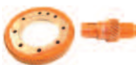
Club Car Gas 97+, 8:1 Ratio GEAR-004