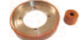
Yamaha Gas, G14-G22, 8:1 Ratio GEAR-005