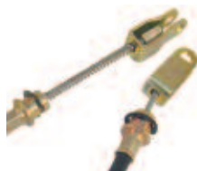
Brake Cable, Passenger, E-Z-Go 90-92 Length: 47¼". OEM: 25187G2/G3; 70414G01. CBL-030