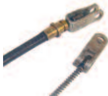
Brake Cable, Passenger, E-Z-Go 91-92 Length: 50¾". OEM: 25789-G2. CBL-037