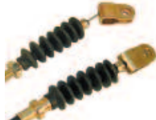
Throttle Cable, Yamaha Gas G2/G8/G9/G14 (Gov to Carb) Length: 21¾". OEM: J38-26312-01-00. CBL-004