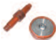
Yamaha 07 Electric, 8:1 Ratio GEAR-014

SEAT KITS, BOXES, CUSTOM SEAT COVERS DIAMOND PLATE BRUSH GUARDS LIFT KITS, FINISH FLARES TIRES, WHEELS, WHEEL ACCESSORIES WINDSHIELDS, TOPS, STRUTS, ENCLOSURES LIGHT KITS, MIRRORS, DASHES, CONSOLES, RADIO SYSTEMS MOTORS, CONTROLLERS CHARGERS & PARTS, BATTERY ACCESSORIES BODY/TRIM, SEATS, SUSPENSION PARTS BRAKE SHOES, BRAKE DRUMS KEYS, SWITCHES, SOLENOID GAS CAR PARTS BELTS, CABLES, HARDWARE, PERFORMANCE PARTS