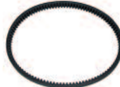
Drive Belt, E-Z-Go Gas 1988 Only OEM: 23557G1. BLT-0020