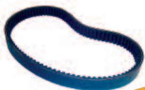
Drive Belt, Yamaha G2, G8-9, G14, G16, G20-22 4-Cycle Gas 85+ OEM: J55-G6241-00; J38-46241-00. Item # BLT-0001