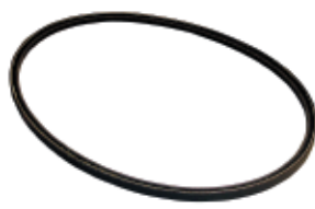
Generator Belt, Club Car Gas 92-93 & 95-96 OEM: 1015241. BLT-0011