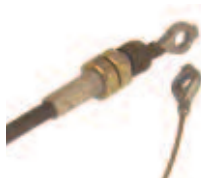
Accelerator Cable, E-Z-Go Marathon 91-94 Length: 33⅞". OEM: 25694-G01. CBL-035