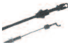
Throttle Cable, Governor to Carb, E-Z-Go Gas 02+ Length: 52¼". OEM: 72714G01. CBL-051