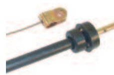
Choke Cable, Dash, Yamaha G2/G8/G9 Length: 87". OEM: JF2-F6331-09. CBL-010