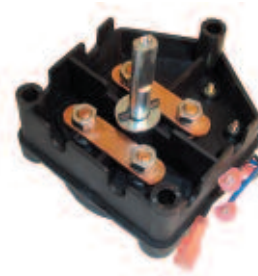
Club Car DS 48V Electric 96+ and 36V with Controller 90-94 FR-022