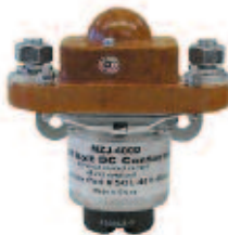
Heavy Duty Solenoid, 400 Amp, 48 Volt SOL-1022