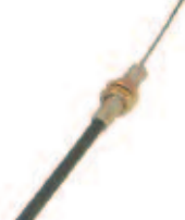
Choke Cable, E-Z-Go 89-92, 2 Cycle Length: 38¼". OEM: 22431-G1. CBL-028