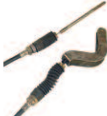
Forward/Reverse Cable, E-Z-Go 91 & Up Length: 40". OEM: 25691-G01. CBL-031