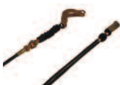
Forward/Reverse Cable, Yamaha G2/G8/G9 Need 2 per car. Length: 47". OEM: J55-G6371-00; J38-G6371-00. CBL-003