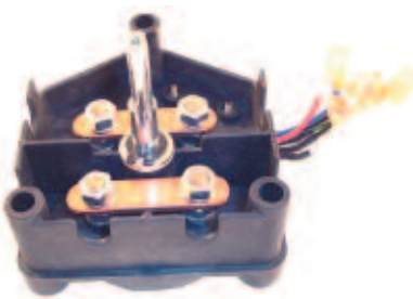
Club Car DS 48V Electric 96+ FR-021