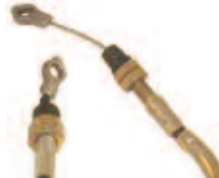
Accelerator Cable, E-Z-Go 89-94 2 cycle Length: 56". OEM: 22334-G1. CBL-027