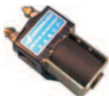
Heavy Duty Solenoid, 200 Amp, 72 Volt SOL-1024