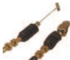
Accelerator Cable, Yamaha Gas G8 only Length: 67½". OEM: JF2-F6311-01. CBL-011