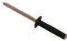
Split Sides Rivet, 3/16 x 3/8 x .450 Head Dia. OEM: 71055G01. RIV-009