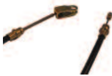
Brake Cable Set/No Bracket E-Z-Go Med/TXT Length: 47½". OEM: 70273-G03; 70716G03. CBL-046A