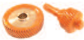
Club Car Gas/Elec 88-96 Kawasaki 97+, 8:1 Ratio GEAR-001