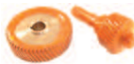
Club Car Gas/Electric 88-96, Kawasaki 97+, 6:1 Ratio GEAR-002