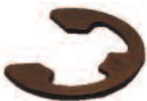
Cable Retaining Clip, Club Car, Gas and Electric, 81+ OEM: 764; 7644; 1011779. CBL-100