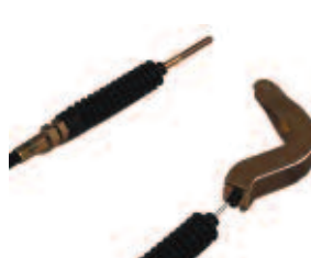
Forward/Reverse Cable, E-Z-Go Workhorse 96 & up Length: 45¼". OEM: 72341-G01. CBL-019