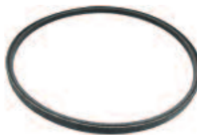
Generator Belt, E-Z-Go 4 Cycle OEM: 26414G01. Item # BLT-0018