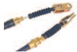
Brake Cable, Driver & Psngr, Club Car 81-99 Length: 42". OEM: 1011403; 1011125. CBL-022