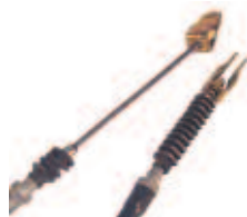
Brake Cable, Passenger, Yamaha G1A+E/G2E/G9E Length: 48½". OEM: J56-F6351-01-00. CBL-002