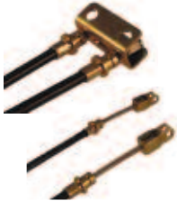
Brake Cable Set w/Bracket, E-Z-Go Med/TXT Length: 47½". OEM: 70273-G03; 70716G03. CBL-046