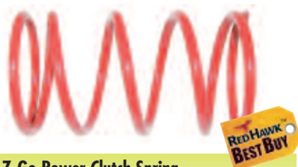
E-Z-Go Power Clutch Spring Item # CP-0101

Add more low end torque to your cart :: Install on driven clutch on rear end for smoother take-off