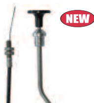
Choke Cable, E-Z-Go MG5/Shuttle 03+ Length: 60¼". OEM: 72401G01. CBL-059