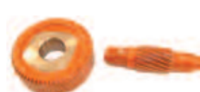
Yamaha G14/G16/ G19, 15:1 Ratio GEAR-012