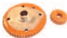
E-Z-Go 98+, Small Bearing, O.D. 1.378, 6:1 Ratio GEAR-008