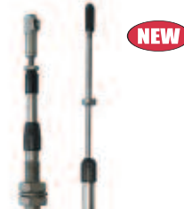
Forward/Reverse Cable, E-Z-Go MG5 Shuttle Length: 66¼". OEM: 72734G01. CBL-061

SEAT KITS, BOXES, CUSTOM SEAT COVERS DIAMOND PLATE, BRUSH GUARDS LIFT KITS, FINNER FLARES TIRES, WHEELS, WHEEL ACCESSORIES WINDSHIELDS, TOPS, STRUTS, ENCLOSURES LIGHT KITS, MIRRORS, STRUTS, ENCLOSURES DASHES, CONSOLES, RADIO SYSTEMS MOTORS, CONTROLLERS CHARGERS & PARTS, BATTERY ACCESSORIES BODY/TRIM, SEATS, SUSPENSION PARTS BRAKE SHOES, BRAKE DRUMS KEYS, SWITCHES, SOLENOID GAS CAR PARTS BELTS, CABLES, HARDWARE, PERFORMANCE PARTS