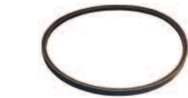
Drive Belt, Club Car Gas 88-91 (not for OHV engine) OEM: 1014081; 1017188. BLT-0004