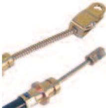
Brake Cable, Driver, E-Z-Go Medalist/TXT 94+ Length: 34¾". OEM: 28084-G04; 25884G04. CBL-040