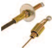
Accelerator Cable, Club Car 97-03.5, FE 290 & 350 Length: 35¾". OEM: 1018325-01. CBL-015