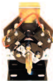
E-Z-Go Non-DCS Electric 94+ FR-020

Beefed up F&R switches for modified cars. If a high amp controller is installed you need these switches.