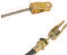
Brake Cable, Driver, E-Z-Go 90-92 Length: 35¾". OEM: 25187-G1; 70714G01. CBL-029