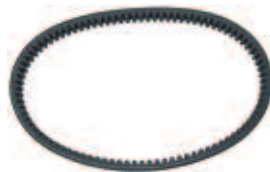
Drive Belt, E-Z-Go 2 Cycle Gas 89-91 OEM: 22337G1. BLT-0019