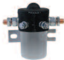
Heavy Duty Solenoid, 200 Amp, 24 Volt SOL-1026