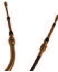
Forward/Reverse Cable, Club Car 98-03.5 Length: 51¾". OEM: 1019515-01. CBL-016