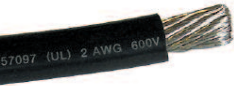
4 Gauge Bulk Battery Cable Available by the foot. BAT-2001