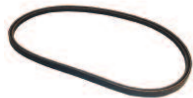
Generator Belt, E-Z-Go 2 Cycle Gas 80-93 OE OEM: 16548G1. BLT-0013